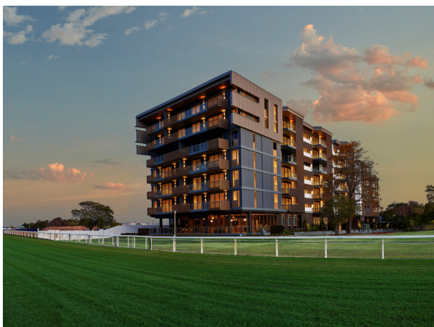
Bernborough Ascot - Completion of Stage 1

the Bernborough site. This is a significant advance for the village as it allows the full aging-in-place experience. We welcome Opal to the BRC community. We remain excited for the future of Bernborough.