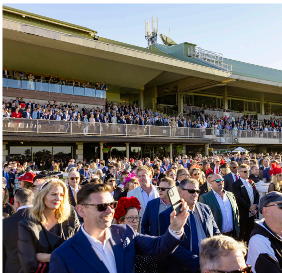
Spectators on TAB Stradbroke Day 2022