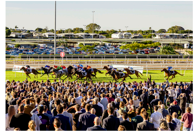
Crowds on TAB Stradbroke Day

During 2022, all directors and the CEO completed the AICD company directors course. This comprehensive course is a benchmark standard for directors on modern boards.