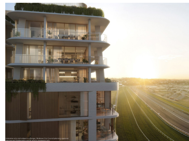
Artist impression - Charlton House

The third and fourth buildings in Ascot Green are progressing well with the Development Application approved by Council earlier this year and construction commencing on the third tower, Charlton House, in July this year. At the time of writing, the apartments in Charlton House were over 60 per cent pre-sold. Completion is expected on Charlton House in mid-2024. The third and fourth buildings will offer a unique design compared to the existing towers and will offer premium trackside apartments and amenities including rooftop dining, swimming pool, EV charging and lush sub-tropical gardens.