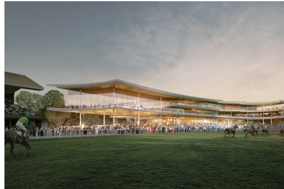
Artist impression - The Terraces Eagle Farm Racecourse

In the past two years we have delivered on the following goals in our strategic plan: