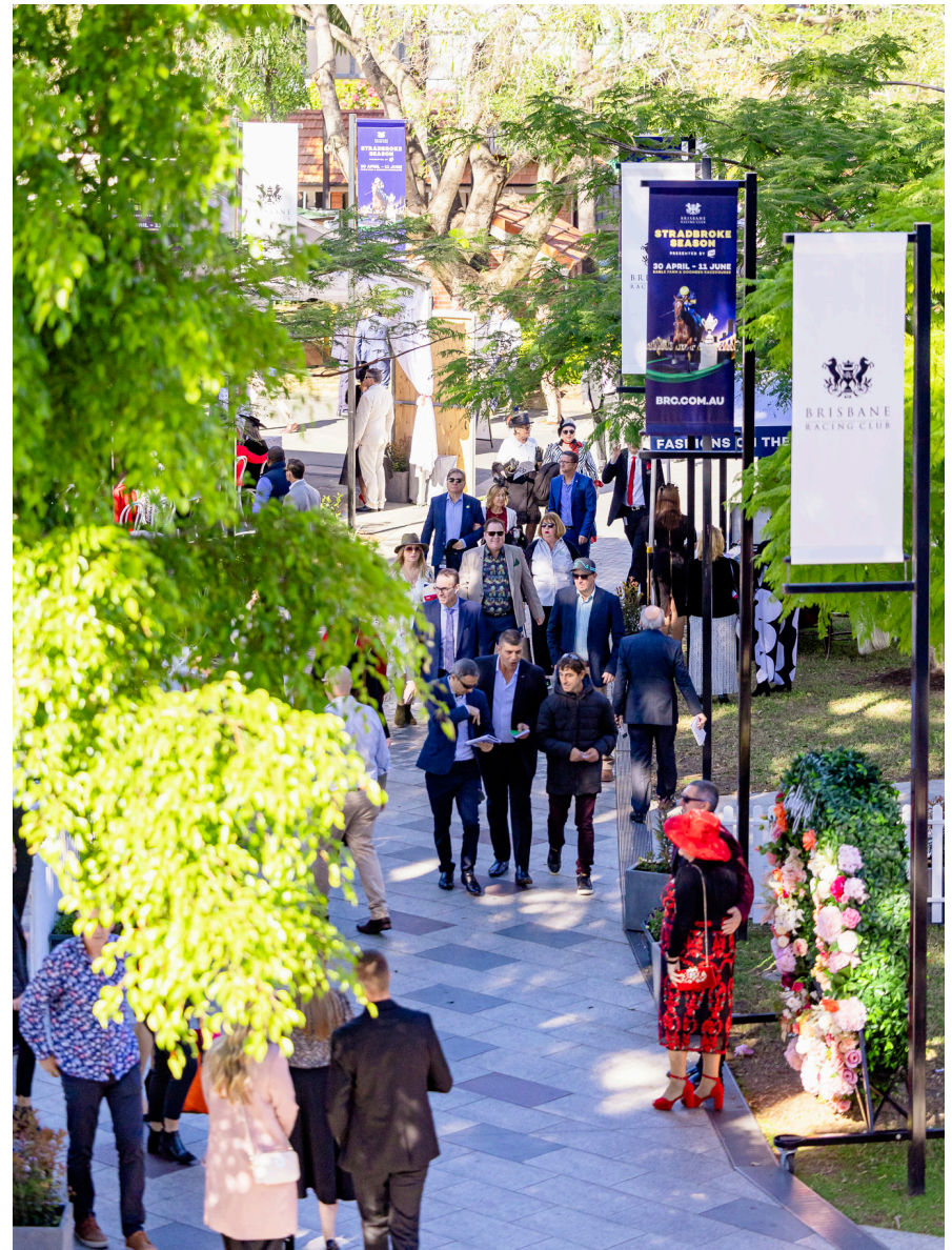
Racegoers attending TAB Stradbroke Day

The team at BRC appreciates our purpose is to be a great race club for many years to come. The BRC team has been busy this year delivering a calendar of events for the enjoyment of every segment of our Membership base from families and racing carnival attendees to concert goers, fashion lovers and wine buffs. Our aim is to make BRC membership the best lifestyle membership in Queensland.