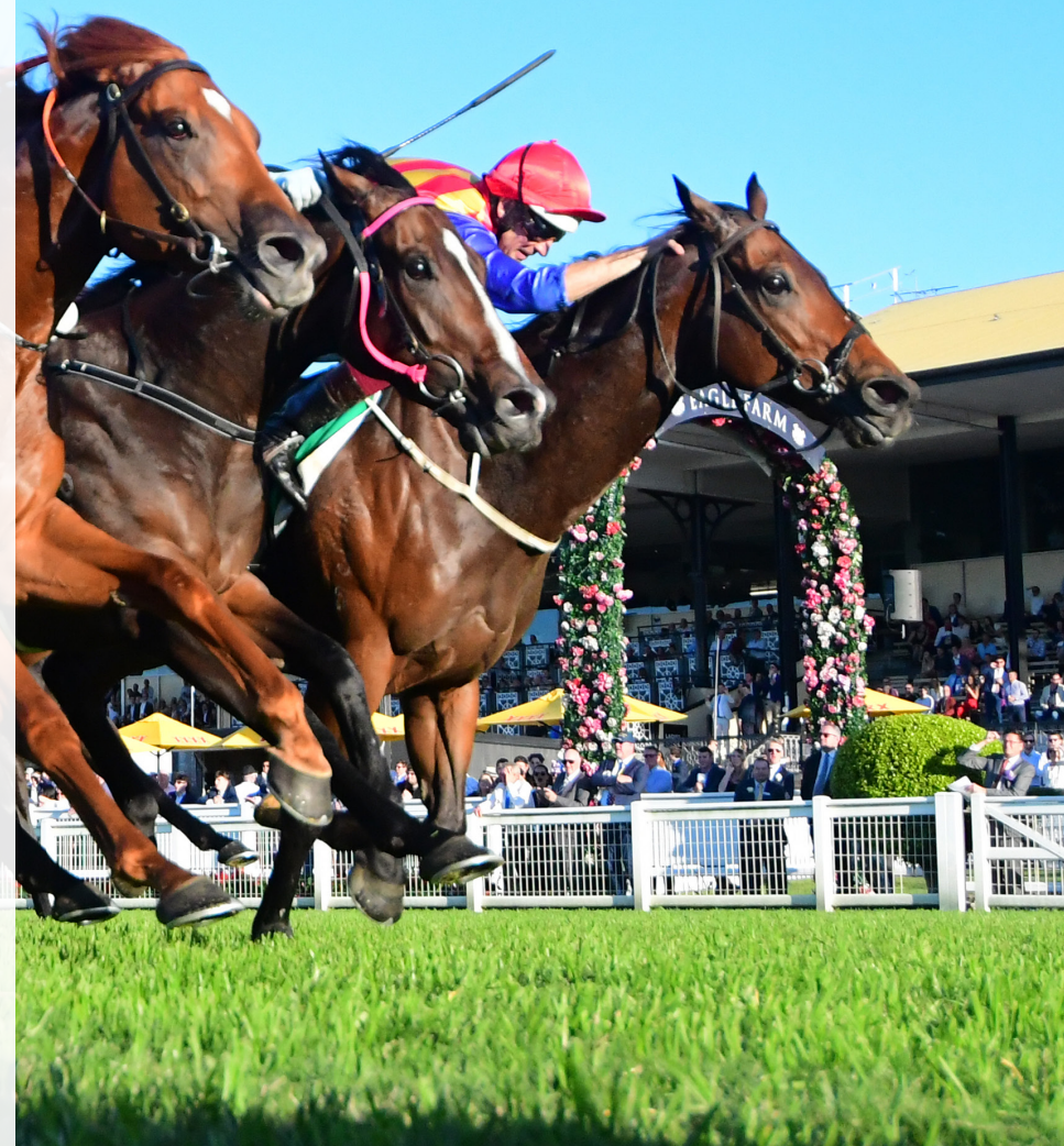
Photo finish of the 2022 TAB Kingsford Smith Cup