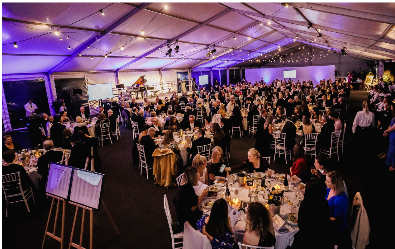
Opera Queensland Gala Ball held at Eagle Farm Racecourse

staff and many hundreds of casual employees who work long and unusual hours to keep the wheels turning on the BRC's diversified business model. The positive culture and the team's ability to perform at a high level are very obvious when we look at outstanding results across the board.