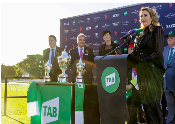
Premier Anastacia Palaszczuk on TAB Stradbroke Day

Farm track now well on the way to providing the elite racing surface for which it was renowned for many years. Crowds have begun returning to normal social patterns and we expect attendance to rebound to historic levels. The upcoming Spring and Summer carnivals have been further enhanced with increased prizemoney and updated race programs.