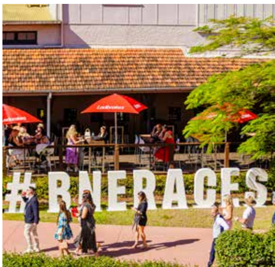
Eagle Farm Racecourse during The Star Stradbroke Season