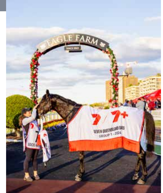
Seven Qld Oaks 2024