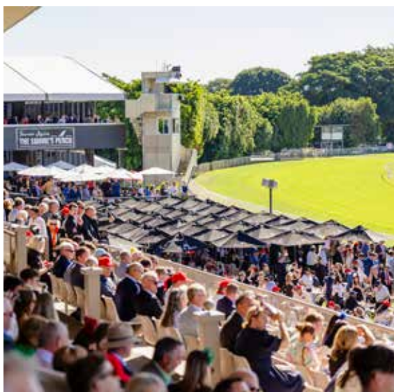
The Star Stradbroke Day 2024