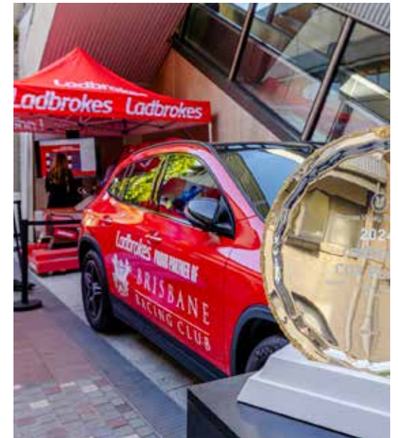
Ladbrokes, win your way to the Cox Plate Competition on The Star Stradbroke Day 2024