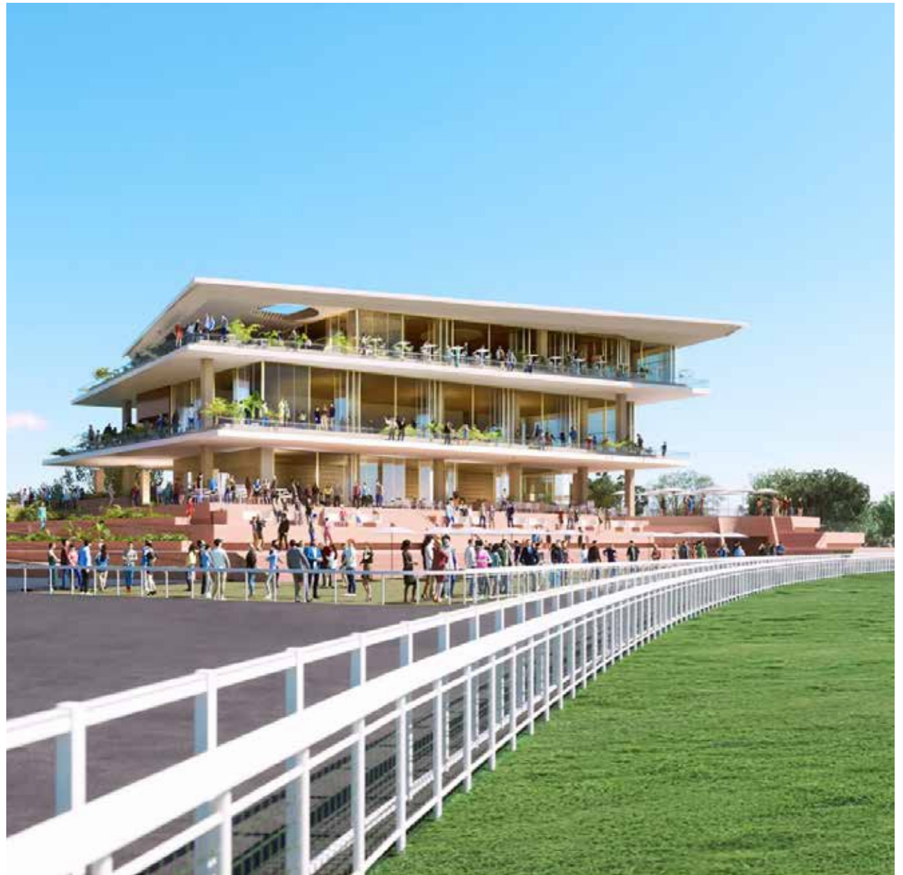
Artist's impression - The Terraces, Eagle Farm Racecourse